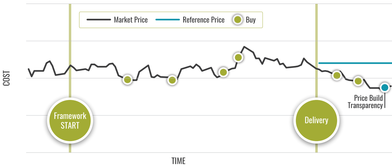
CHART OUTLINING HOW THE PWP BASKET OPERATES

The Purchase Within Period option facilitates the purchase of a portion of site volume prior to delivery for a six-month period, whilst the remaining volume may be purchased month ahead or even day ahead. Volume is purchased up to four years in advance of consumption and may be purchased over multiple transactions. The difference between the billed reference price and the out-turn price is settled in the form of a six-monthly reconciliation (p/therm or p/kWh).