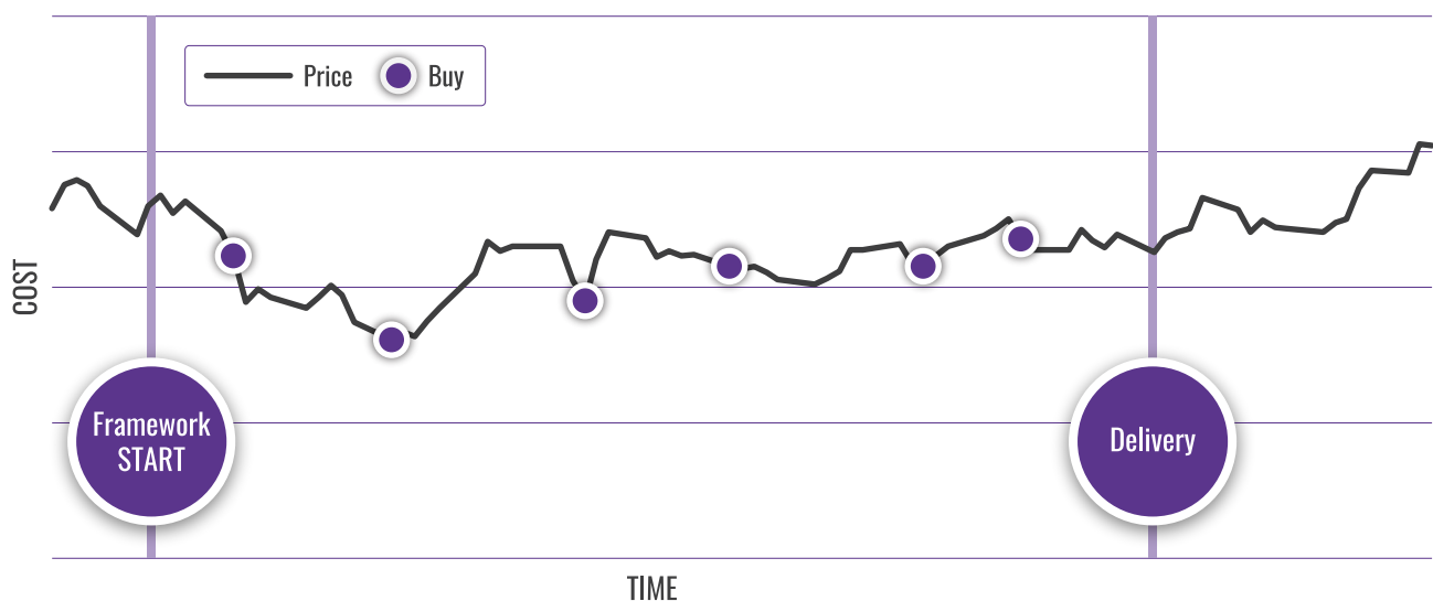
CHART SHOWS HOW THE PIA BASKET OPTION OPERATES

The Purchase in Advance option facilitates the purchase of all site volume prior to delivery for a twelve-month period. Volume is purchased up to four years in advance of consumption and may be purchased over multiple transactions. The sum of all trades will be used to calculate the aggregated energy price. Pass-through charges will be added to arrive at the delivered p/therm or p/kWh.